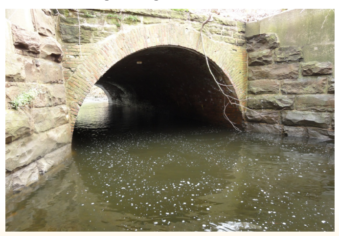
This structure [circa late 1800's] is structurally and hydraulically sound. It will need to be extended to accommodate a second track.