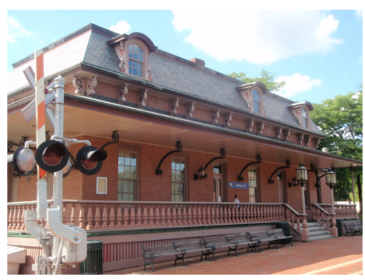
At several locations, work will take place adjacent to historic station buildings. The design and construction of platforms, pedestrian overpasses, and parking facilities at these locations will need to be sensitive to the historic qualities of these stations. This photo shows the existing Windsor station.

One section of the corridor, Meriden to Newington, had received prior environmental approval and is already advancing into final design.