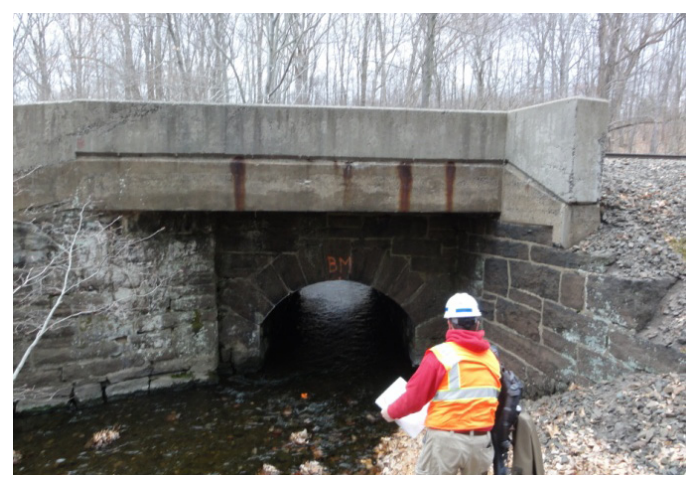
Engineers have conducted field condition surveys of culverts and bridges along the NHHS corridor.