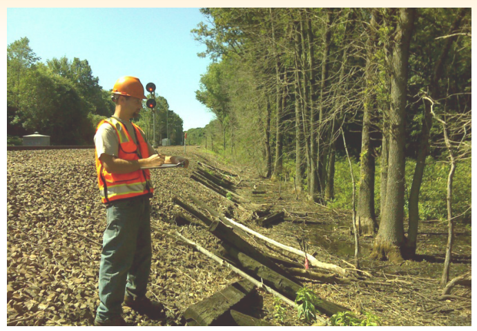
Wetland scientists collected field data on wetlands along the NHHS corridor.