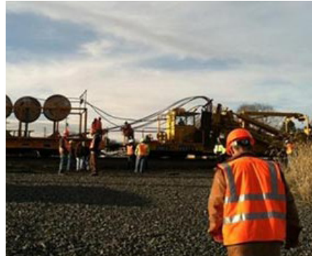
Cable installation construction work in Hartford (left) and Newington (right).