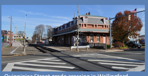
Quinnipiac Street grade crossing in Wallingford.

The NHHS rail corridor includes 38 public at-grade crossings. The current plan calls for elimination of two at-grade crossings near Hartford – Flatbush Avenue and Flower Street – as part of the New Britain-Hartford Busway Program (CT Fastrak). Also, the Brooks Street at-grade crossing in Meriden will be closed as part of the upgrade of the Meriden Station. The Department of Transportation will be conducting separate public hearings once the designs for the improved at-grade crossings are finalized.